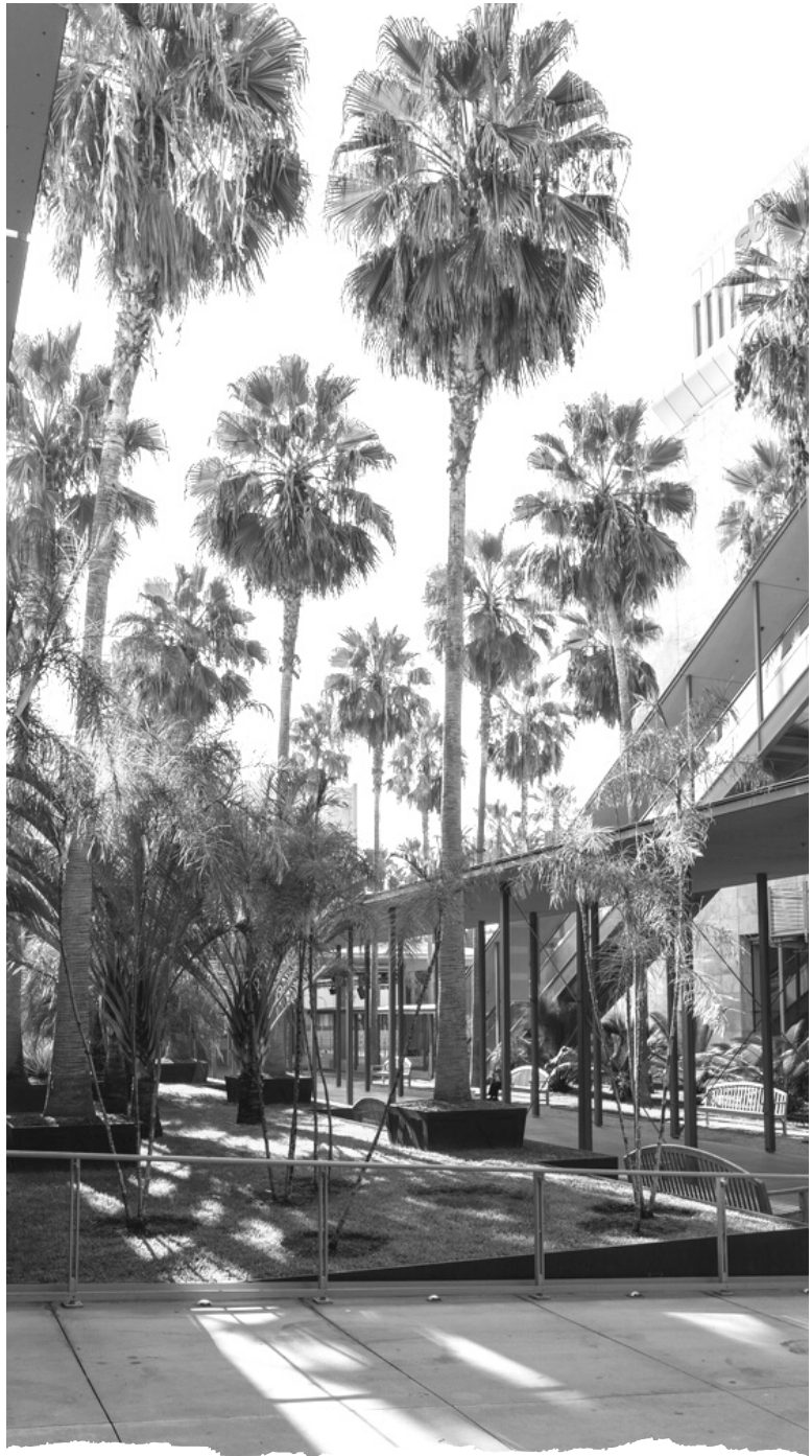
Primal Palm Garden, Robert Irwin

Next level: For an additional challenge, incorporate a word in your writing that you can see from where you are right now.