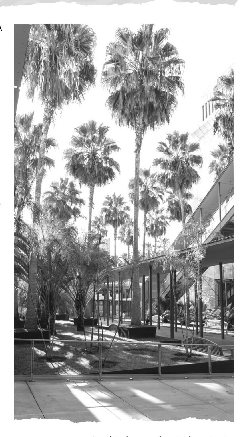
Primal Palm Garden, Robert Irwin

Next level: For an additional challenge, incorporate a word in your writing that you can see from where you are right now.